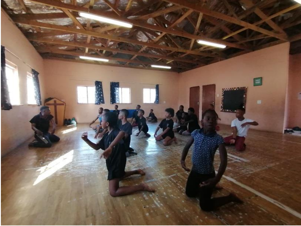
Below: Students ready to be transported to the Jazzart Audition in Cape Town