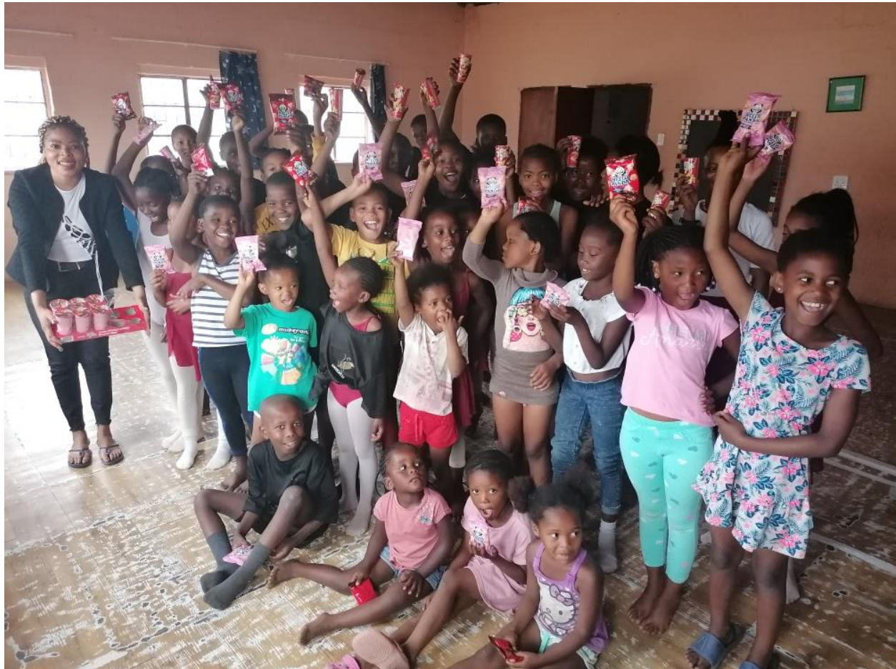
Above: Our students happy to receive the treats from RAM