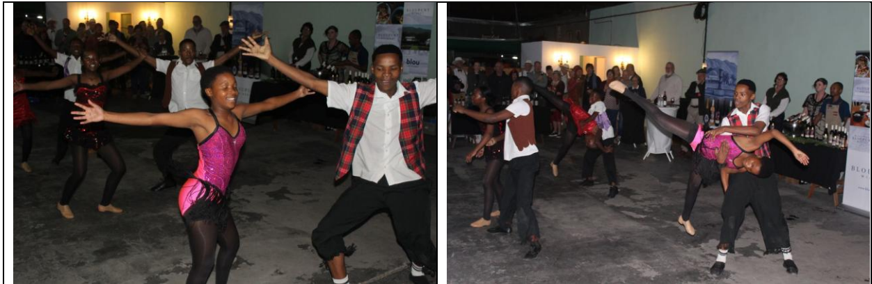
Above: The Dancescape Dancers perform at this year's Long Table Event.