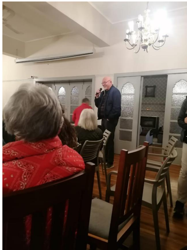
Above: I attended a Montagu Talk talk after which DSA received a cash donation