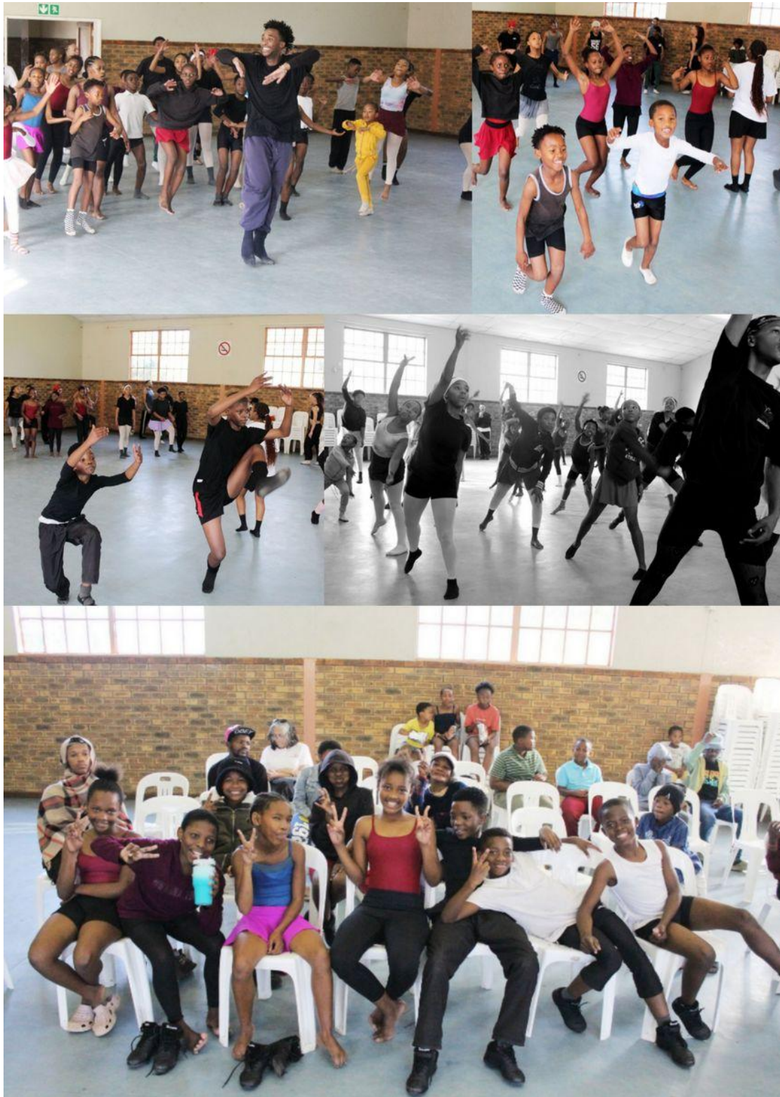
Above: DSA students attend a Jazzart workshop.