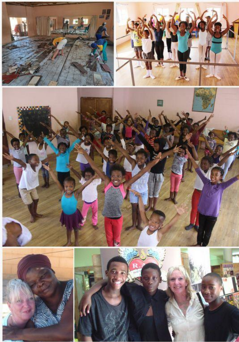
Above: This A2 slide is part of the Dancescape South Africa story board soon to be displayed at the new office venue, in the KVV Building.