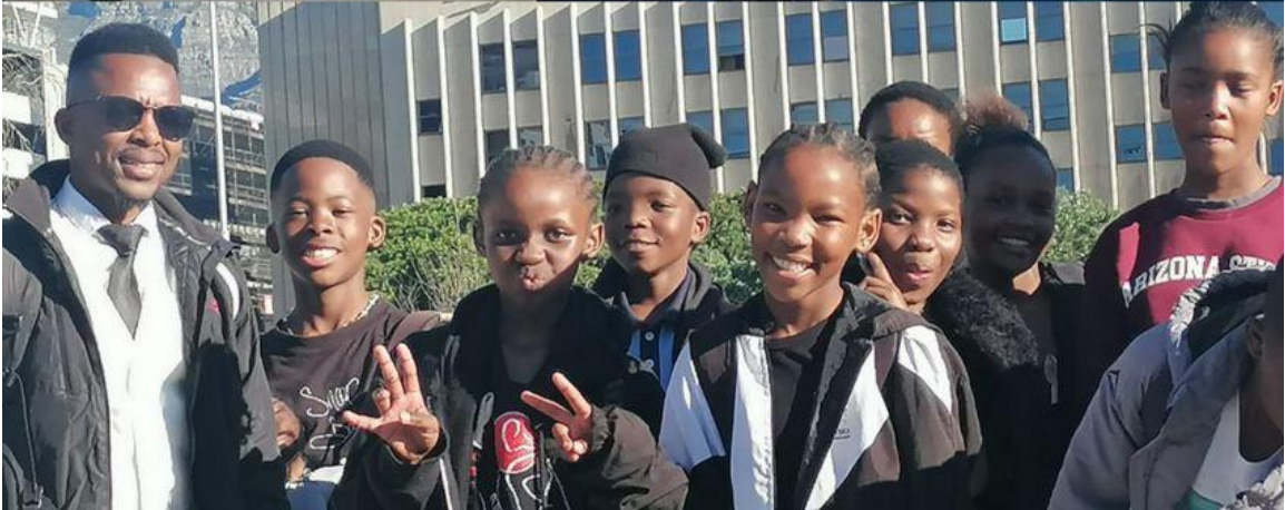
Above: Our dancer's enjoying the outing.