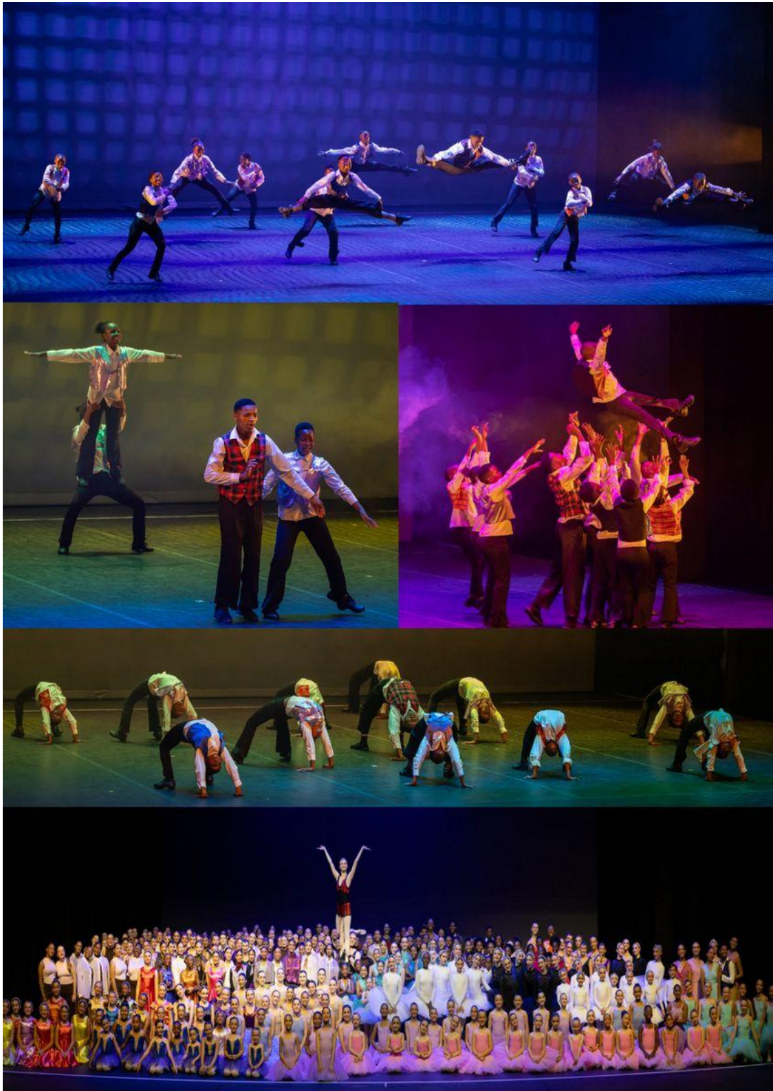
Above: DSA dancers performing at this years Centre Stage Production.