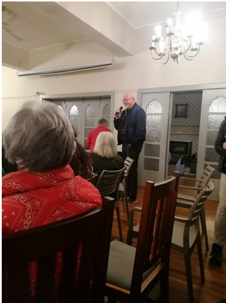
Above: I attended a Montagu Talk talk after which DSA received a cash donation